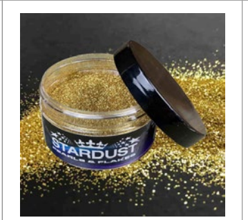
LIGHT YELLOW GOLD A0202_0.2mm