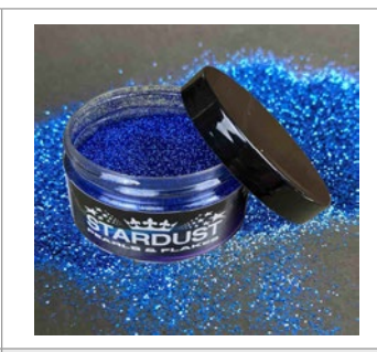
SAPPHIRE BLUE A0705_0.2mm