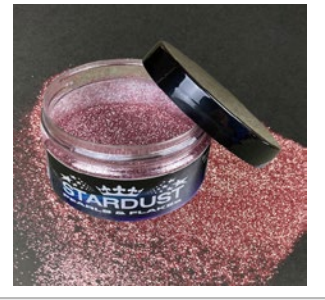
ROSE RED A0907_0.2mm