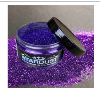
ROYAL BLUE PURPLE A0808_0.2mm