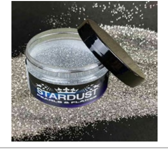
BRIGHT SILVER A0120_0.2mm