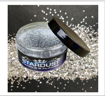
BRIGHT SILVER A0120_0.6mm