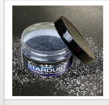
SILVER GREY A1008_0.2mm