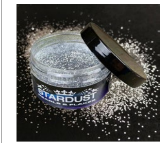
BRIGHT SILVER A0120_0.4mm