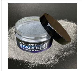
BRIGHT SILVER A0120_0.05mm