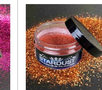
RED COPPER A0208_0.2mm