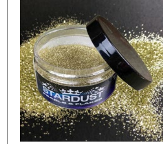
WEAK GOLD A0215_0.2mm