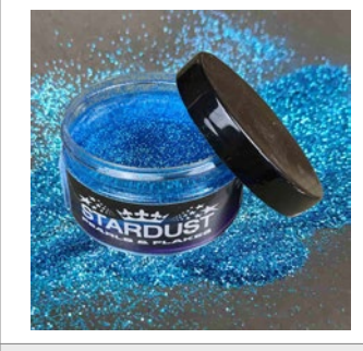
SKY BLUE A0706_0.2mm