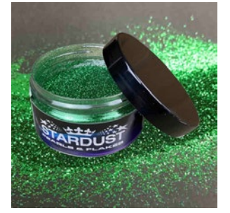
JADE GREEN A0622_0.2mm