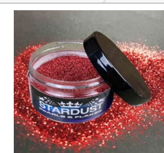
DARK JESTER RED A0314_0.2mm