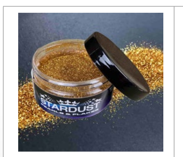
RED GOLD A0208_0.2mm