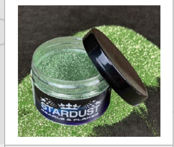
WILLOW GREEN A0617_0.2mm