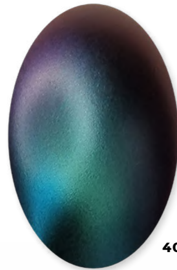
401 - B