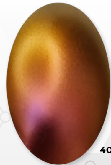
404 - B