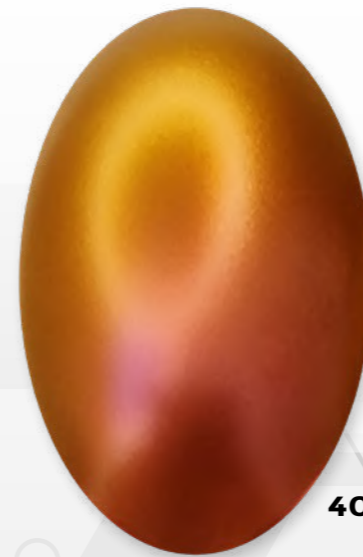
404 - W