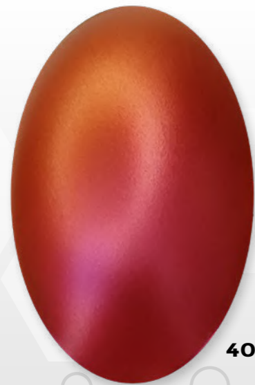
403 - W