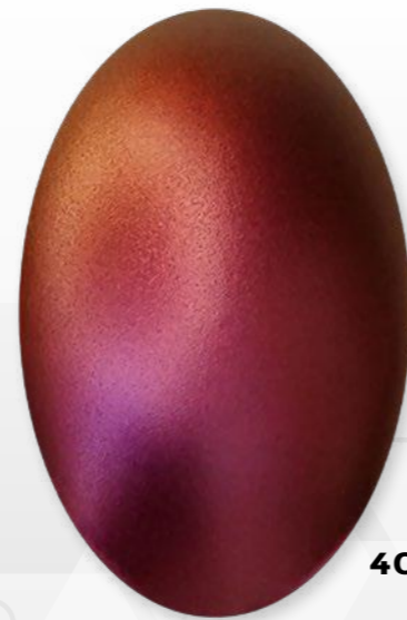
403 - B