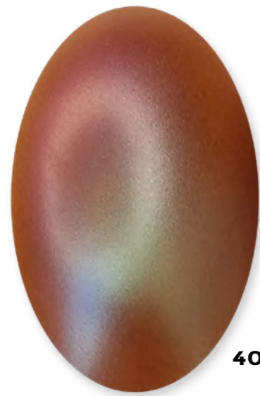
401 - W