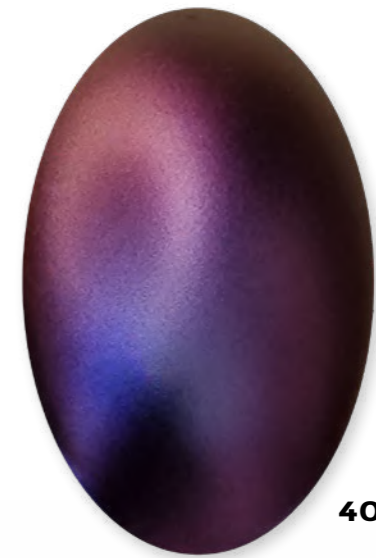
402 - B