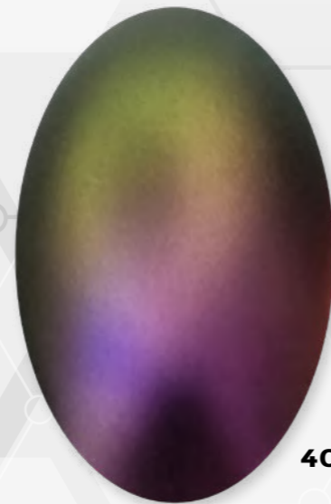
405 - B