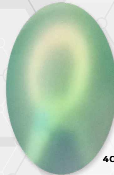
406 - W