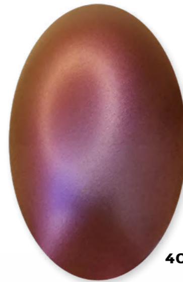
402 - W