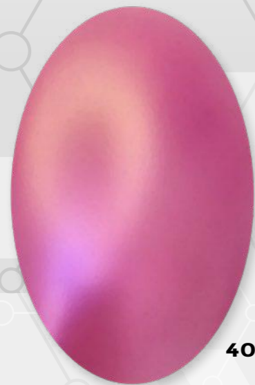
405 - W